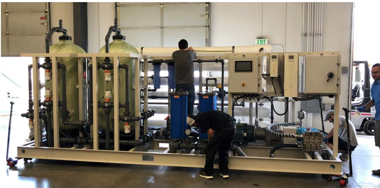
Building a Titan system in the FCI Watermakers factory

One of FCI's customers introduced them to Opto 22's groov View, a browser-based software tool for building an operator interface to systems and equipment. The interface can be viewed on mobile devices as well as computers—anything with a web browser, from a smartphone to a web-enabled HDTV.